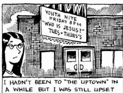
A WHILE BUT I WAS STILL UPSET TO SEE IT'S NOW A PENTECOSTAL CHURCH-WHAT'S UP WITH THAT?