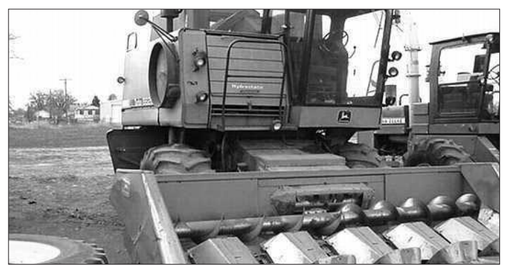
Farmers say they are constantly attaining greater efficiency, but all possible profits are taken by powerful agriculture technology corporations and declining prices from nearly-monopolized buyers.

two multinationals pack the vast majority of Canadian beef. Similar concentrations exist in almost all sectors.