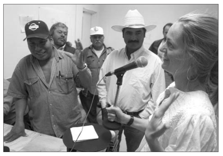
Prometheus Radio Project volunteers working with the Coalition of Immokalee Workers to build Radio Consciencia. JJ Tiziou

The Coalition of Immo-Workers, comfarmworker munity-based in southwest organization Florida, was a successful lowpower radio applicant. From December 5-7, Prometheus Radio Project barn raised its low-power/community radio station. Like an old fashioned gathering where neighbors pitch in to construct a building, CIW's Radio Conciencia in Immokalee, Florida was assembled by volunteers, from the antennae mast to the microphones. The station will be an