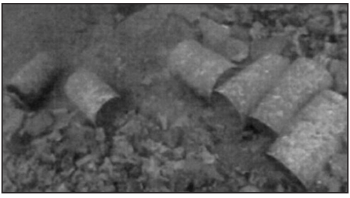
Corroded barrels of mustard gas like those scattered along the Atlantic coast.

After the Second World War, Canada and Britain declared much of their chemical and biological stockpiles as surplus and dumped them both inland and in the ocean. There is an estimated one billion pounds of mustard gas and related chemical weapons munitions at the bottom of the world's oceans, but more insidiously, there is a large number