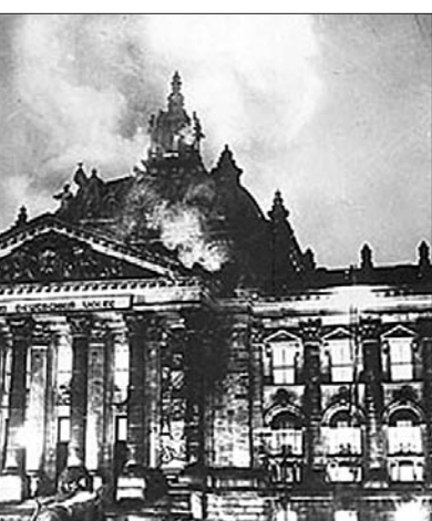
The burning of the Reichstag by terrorists allowed Hitler to sieze power. Myth questions similar themes in contemporary America from an Australian perspective.

Is it true that Sydney theatre companies were simply too scared to bring this play to Sydney audiences? Is it a reflection, perhaps, on the extreme conservatism and reluctance to