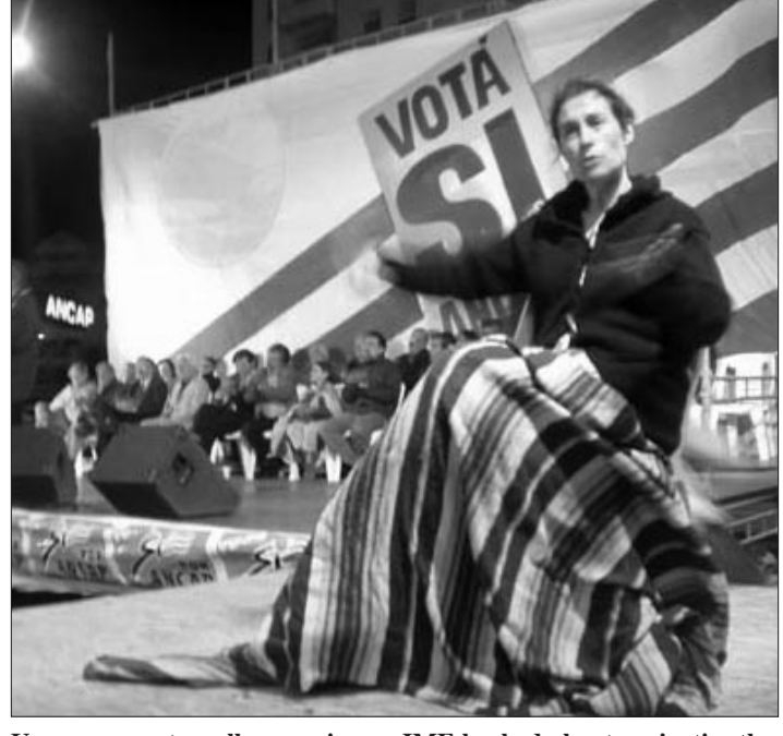
Uruguayans at a rally opposing an IMF-backed plan to privatize the nationally-owned oil company.

As many as 7 million Iraqi workers–70 per cent of the country's workforce–do not have jobs. Those workers who have hoped to find security or improved situations by forming unions have been disappointed in recent weeks by the US-controlled Coalition Provisional